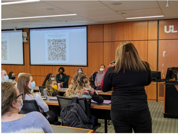
Clinical Conversations with University of Louisville Medical School