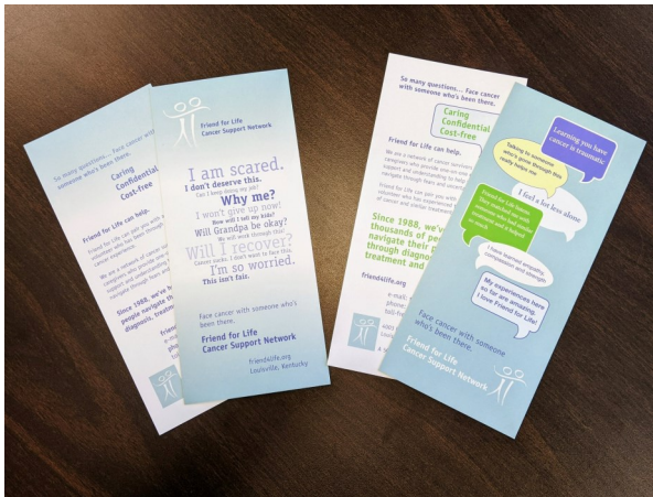
New rack card designs by Jan Conradi!