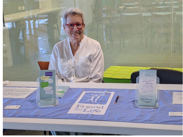
Out and about at events again!